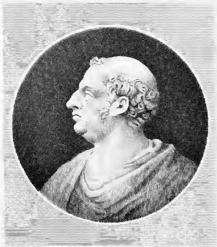
11 1791 FREDERICK DUKE OF YORK. 1791

Engraved by G. Kneller del. J. Smith sculp.